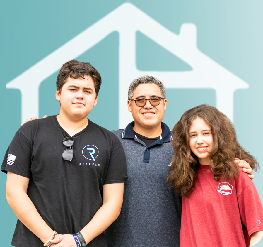
Pictured: Gomez family, previous Goodness Village guests