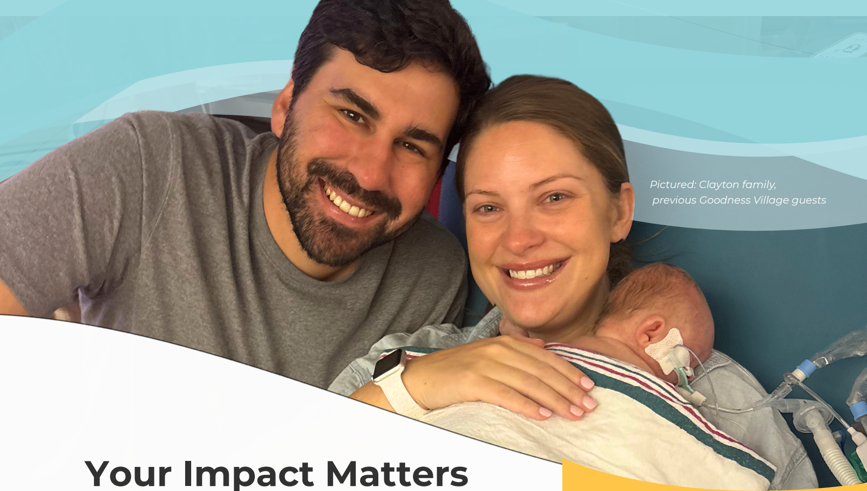
Pictured: Clayton family, previous Goodness Village guests